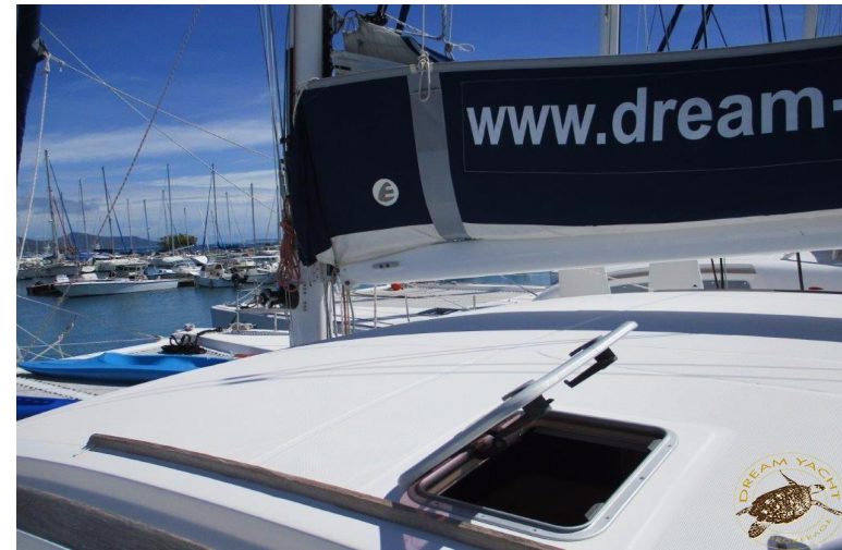
Catana 47 - 2011